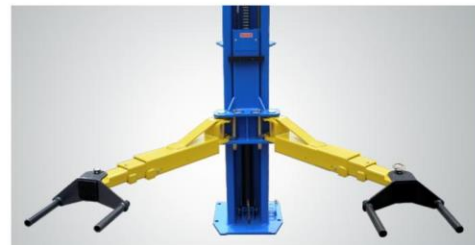
Schematic of installation