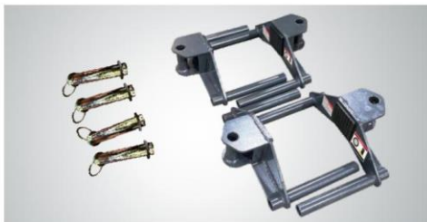
4pcs/set Kits No. 20806